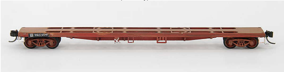
Completed Type 2 model