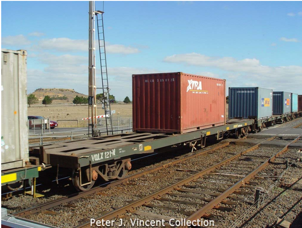
Painted green and with white numerals during the Freight Victoria era.

Painting general: The completed kit should be lightly coated with an etch primer and then given a coat of Steam Era wagon red or equivalent colour from other makers. Steps, shunter steps, grade control valves and cross arm wheel brake are painted white. Freight Australia green should be substituted for the red when either using it as FA/FV.