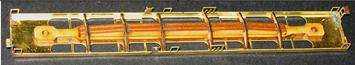
Underframe glued to brass etch. Type 2