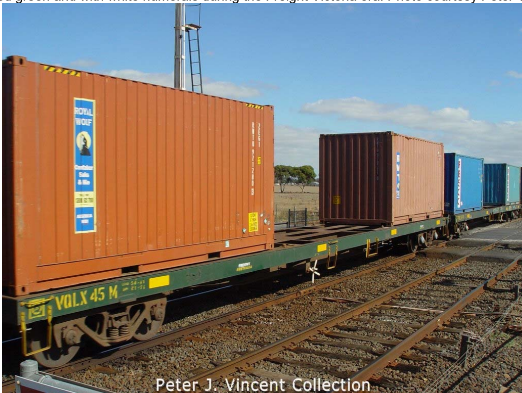
Painted green and with yellow numerals during the Freight Australia era.