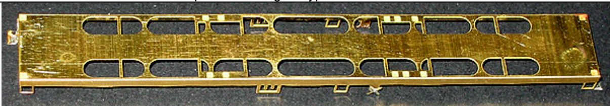
Completed decking Type 2- Top view