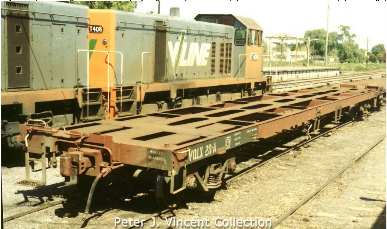
Peter J. Vincent Collection VQLX 28-A, seen here at Shepparton.