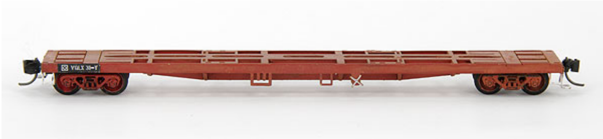
Completed Type 1 model

Weathering: Use pastels or paint to weather the wagon to your taste. Use the photos as a reference.