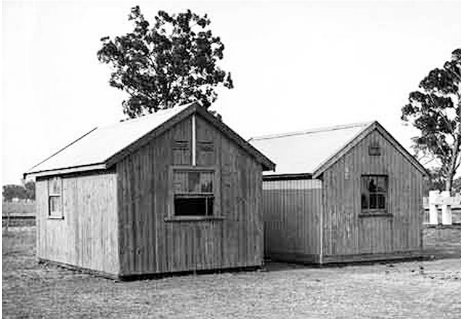
Two 20ft Victorian Railways Portables ready for the rural workers.

**Matches the paint sample taken from the building many years ago