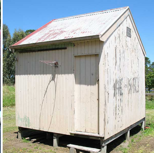
Left: Typical VR 20ft portable still being used by Puffing Billy. Right: After many years of faithful service on the VR, a 12ft portable has been bought by a local farmer and is being used as a small sleep out.

Basic history notes: These kits are based on plans of the original VR portable that has its origins from 1919 and various updates in 1947 and 1972. They were a prefabricated kit that was deposited on-site and assembled with the minimum of fuss. They were based on the successful VR 20ft Portable station and are the same units minus a few features. The portables both the 20ft and 12ft were used for temporary accommodation statewide to meet housing and crew accommodation shortages and sometimes became permanent fixtures at stations, yards and within the grounds of VR Department Residences. They could be found sitting on timber skids or with stumps depending on the climate and White Ant infestations in the area. Surviving examples around the countryside have outlived their bigger and more expensive brothers whilst others have found homes as sheds on farms.