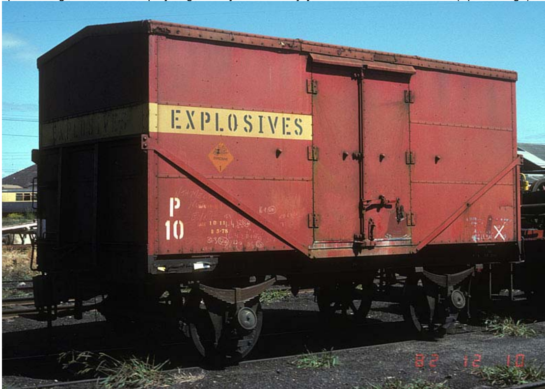
P10 in final form.